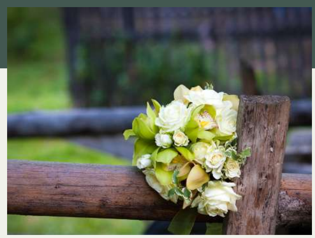
* Packages, prices and menus subject to change.